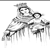
Our Lady of Mount Carmel